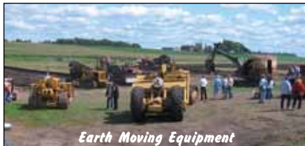
Earth Moving Equipment

Over 500 antique tractors, 250 gas engines, 50 antique cars and trucks, and several full size and scale model steam engines.