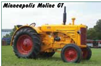
Minneapolis Moline CT