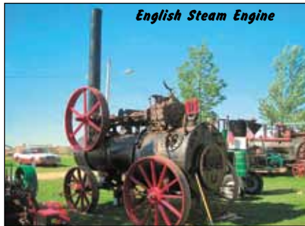
English Steam Engine