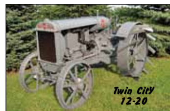
Twin City 12-20