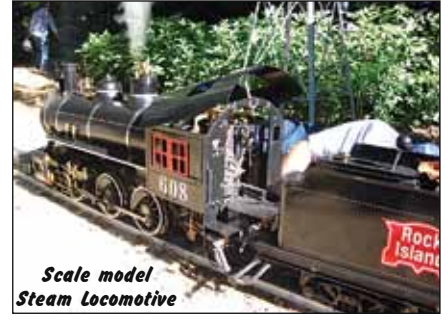
Scale model Steam Locomotive