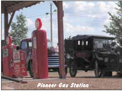
Pioneer Gas Station